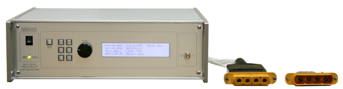
Pulser mainframe (left) with AK9 kit, including the AV-HLZ1-100 output cable (middle) and mating adapter (right)