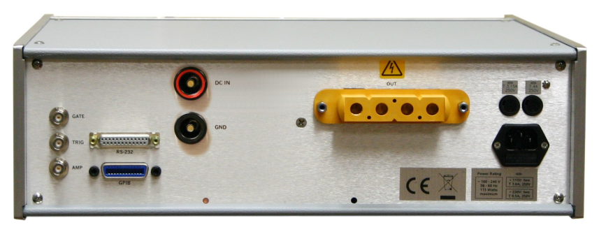
AV-109F Series Rear Panel. (AV-109E models do not have the DC and GND power supply terminals).