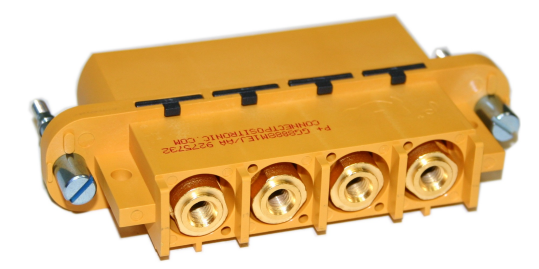
Rear view of the adapter included with the AK9 kit. The outer two contact posts are grounded, and the inner two carry the signal. The user may screw into these posts, to attach the user's load.