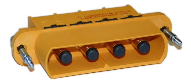
Front view of the adapter included with the AK9 kit. This end may be plugged directly into the rear panel output connector, or into the output end of the AV-HLZ1-100 cable.